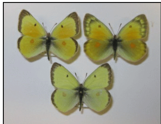
Top: Colias eurytheme Bottom: Colias philodice

My best guess would be that these spring beauties overwintered as chrysalides. I kept one female alive in an attempt to obtain ova. She never produced a single egg. The Colias philodice were another puzzle. They were rather wing worn. I have collected several small bright yellow males of Colias philodice in late October. However, I seldom find them the following springs. While living in Virginia in the late 1970's I encountered Colias eurytheme and Colias philodice in early March, some were hibernators others were not. As you can see in the photograph, the specimens were rather small. They are striking creatures.