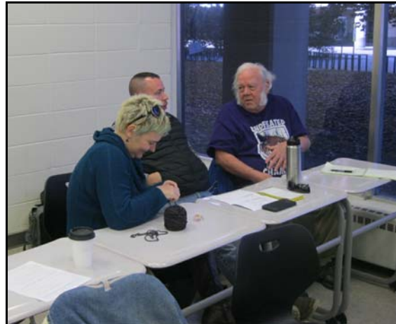
Taking a break during the afternoon session