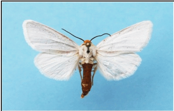
Schinia bimatrix (A State Record)