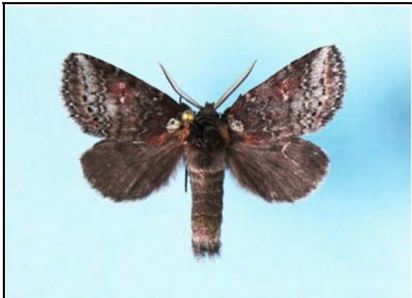
Notodontidae: New genus, new species, to be named in the second MONA Notodontidae fascicle (a manuscript name exists, that some of you may know, but rules of nomenclature prohibit it's use prior to official publication)