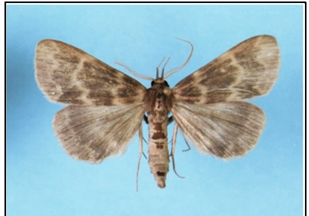
Idia gopheri (Which means there are Gopher tortoises here)